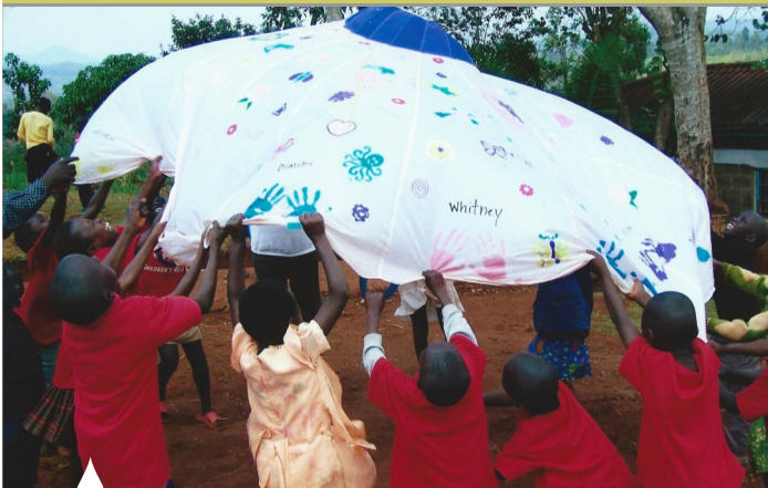
Gift of Love From the Children of St. Nektarios to the Children of Kenya

The Child of God Academy buildings are temporary corrugated shacks with dirt floors, and the classrooms are small, cramped spaces for as many as 30 students. The school has no electricity or running water. Water is provided in containers for washing and the bathrooms are outhouses. The kitchen has a 20-gallon pot on a charcoal fire to prepare one hot meal a day plus a second meal consisting of hot tea and bread.