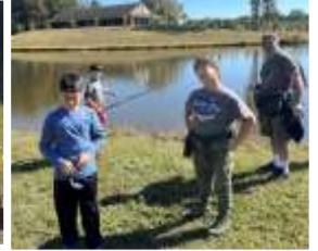
Above: Bell Scout Camp