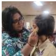
Above: Bobcat Awards and traditional Face Painting