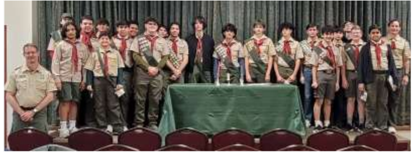
Above: Scout Recognition Ceremony