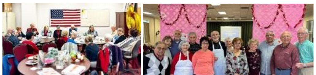
Above left: Our Young at Heart board planning future events Right: Our February hosts

Thank you to our monthly hosts for preparing a great lunch, setting up the room and decor. A special thanks goes out to our board who make sure all the details are covered so everyone has a joyful time with their Young at Heart family. ❖