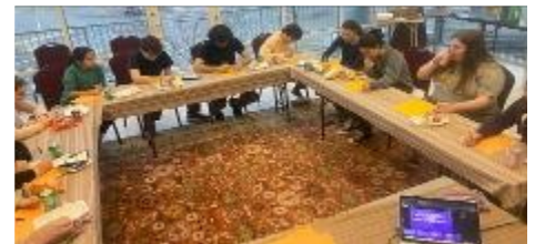
Above: GOYA engaging in a theological session on Love of Neighbor