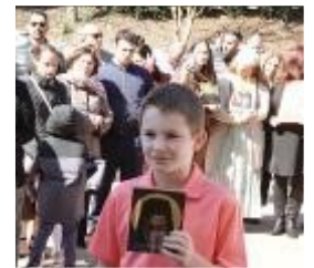
Youth processing with their holy icons during the Sunday of Orthodoxy 2024