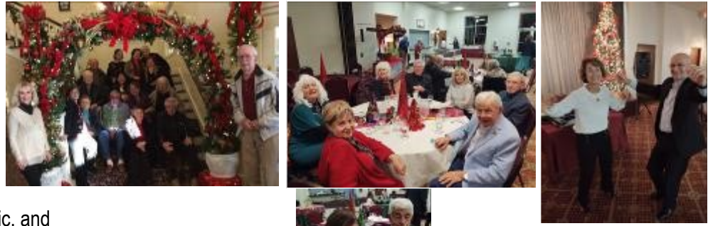
Above & right: Our "Holly Celebration" in December