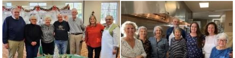
Above: Our January hosts and servers

The January 11 th lunch gathering continued the New Year's celebration. There were the monthly birthday wishes, cake, and singing Happy Birthday. The afternoon was filled with Bingo Fun with lots of prizes.