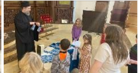
Above: St. Panteleimon Homeschool Co-Op learning about the symbolism and significance of vestments last month