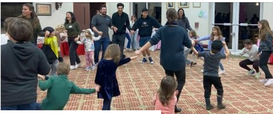
Above photos and below: JOY/HOPE First Friday fun