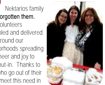
Nektarios family hasn't forgotten them.

all our supported ministries were able to receive great donations from our Philoptochos and those who bought our scrumptious desserts had delicious treats. We offered Thanksgiving and December pick up dates on November 19th and December 17th. All the baking volunteers and baking leads did an amazing job this year making it not only fun, but also delicious. The recipes are fabulous, and newcomers were able to learn how to make such wonderful Greek pastries too.