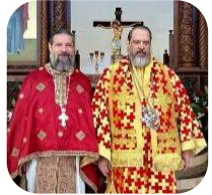
Dodekaemeron, the twelve days of Christmas. ❖