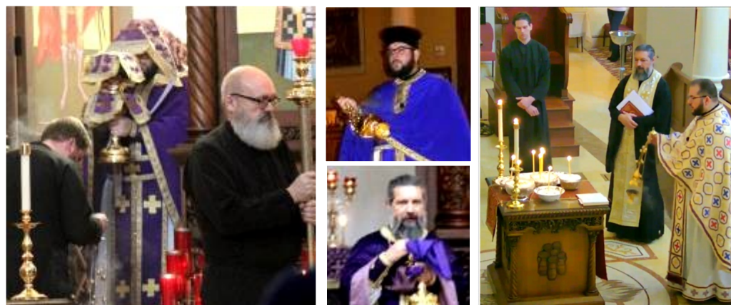
Above: Presanctified Divine Liturgy and Saturday of Souls