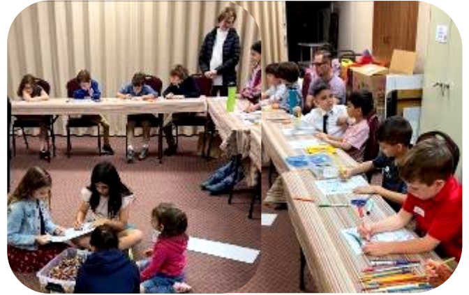
A few photos from our HOPE & JOY Holy Friday Retreat. Our youth learned about the mystical supper, the path taken with the cross of Christ, and made their very own Pascha lambades (candles).