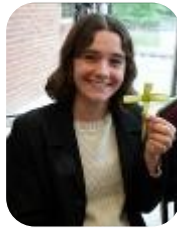
GOYANS making Palm Crosses on Lazarus Saturday