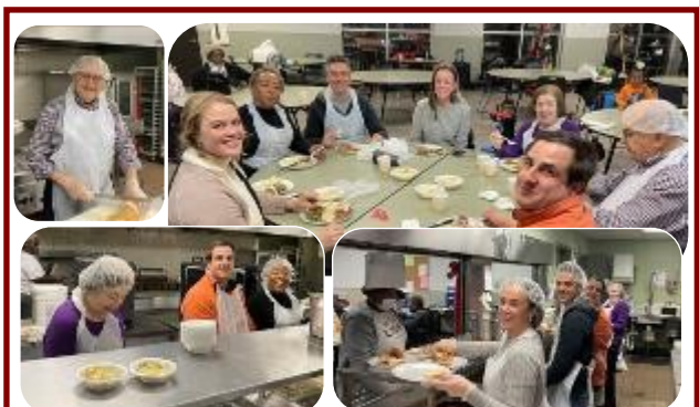
Above photos: The many faces of Angels reflecting the Light of Jesus Christ as they offered love, food and blankets to the to several hundred pained souls at the Salvation Army Center of Hope, who received healing from our Lord in these actions.