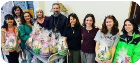
St. Phoebe Ministry making baskets for shut-ins