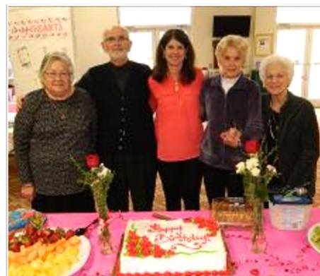
Pictured above: January and February Birthdays