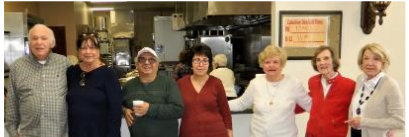
Above: Our January Hosts / Below: Our February Hosts