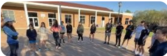
Above: GOYA Come and See Sundays!