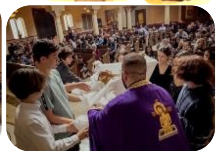
Our teens were very busy on Holy Friday, preparing the church, receiving our Lord's body into the linen sheet, and even helping unload food for the Agape picnic on Sunday. We're so proud of these future church leaders! May God bless them!