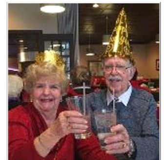
New Year's Eve Luncheon