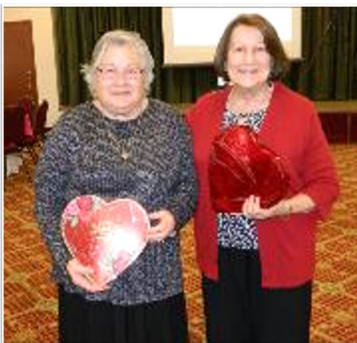
We drew 2 names to be selected as Valentine's Sweethearts